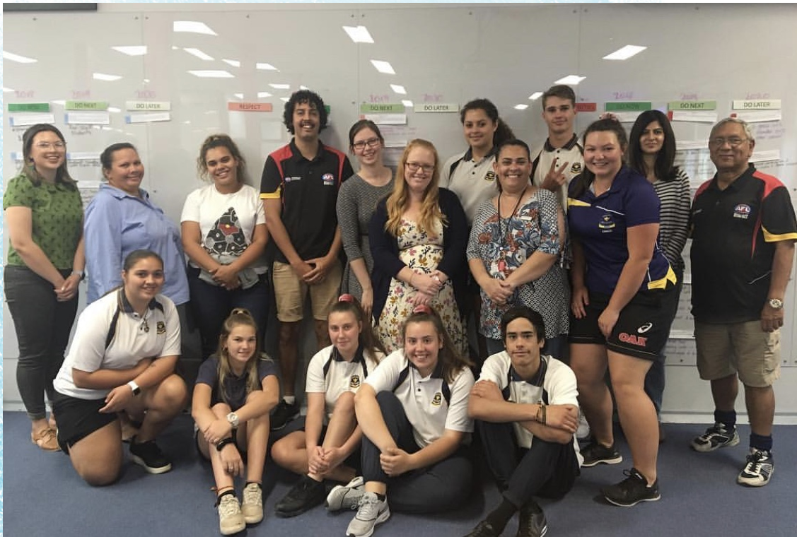
RHHS RAP Working Group